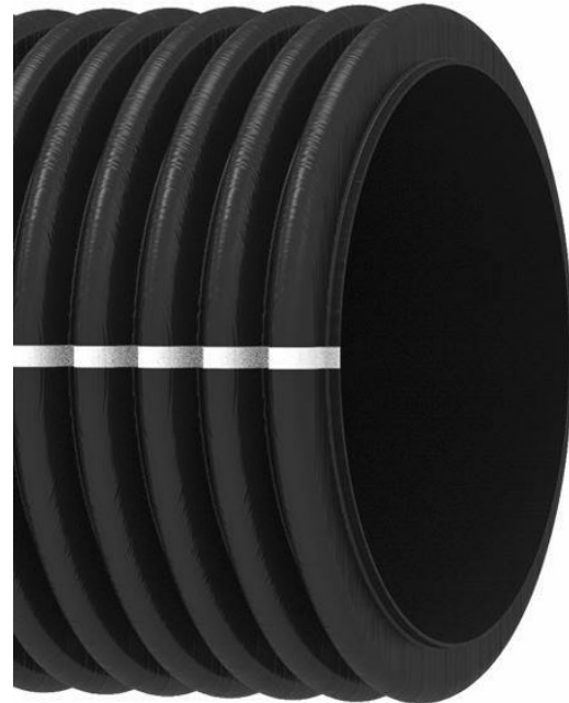
The image is for illustrative purposes only

The pipe will be produced by a company regularly enrolled at the Polieco Consortium D.Lgs. (152/2006 - art. 234) and with the following management systems: -Quality, in accordance with UNI EN ISO 9001; -Environment, in accordance with UNI EN ISO 14001; certified and validated by an accredited third-party institution The manufacturer applies a code of ethics and an organizational, management and control model in accordance with Legislative Decree 231/01 and can provide information on its economic, environmental and social (ESG) impacts as reported by a Sustainability Report in accordance with GRI Standards 2021 certified by an accredited third party.