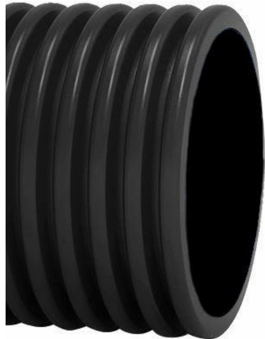
The image is for illustrative purposes only