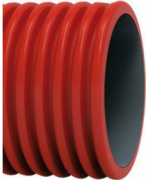
The image is for illustrative purposes only

-Quality, in accordance with UNI EN ISO 9001; -Environment, in accordance with UNI EN ISO 14001; certified and validated by an accredited third-party institution. The manufacturer applies a code of ethics and an organizational, management and control model in accordance with Legislative Decree 231/01 and can provide information on its economic, environmental and social (ESG) impacts as reported by a Sustainability Report in accordance with GRI Standards 2021 certified by an accredited third party.